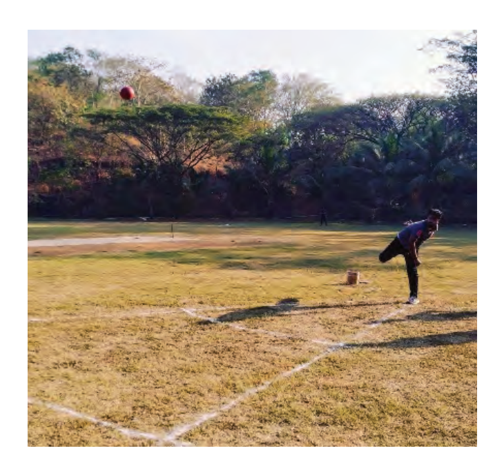
The meet comprised of 12 activities:

8. Athletic meet (24 & 25 January 2020) Sports Committee, NITIE conducted an Athletics Meet in the campus for all the students on the 24th and 25th of January 2020. The event was conducted for the second time in NITIE and saw active participation from students and fellows.