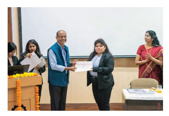
Prize Distribution to the winners of WDC competitions by our Honorable Director

Institute also celebrated the following activities as per Government of India norms for the year 2019-2020.