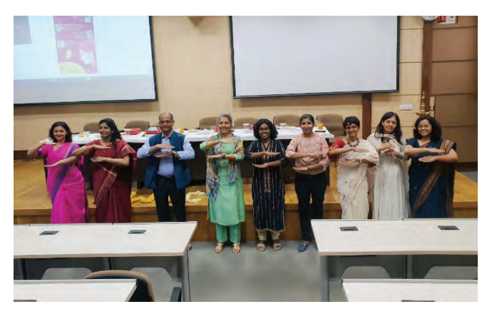
Panel Discussion By WDC Held on 11th March2020: