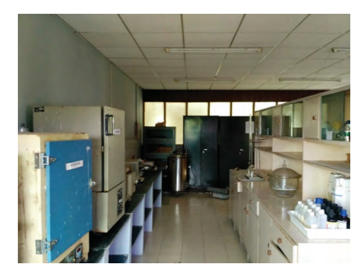
Industrial Environment Lab