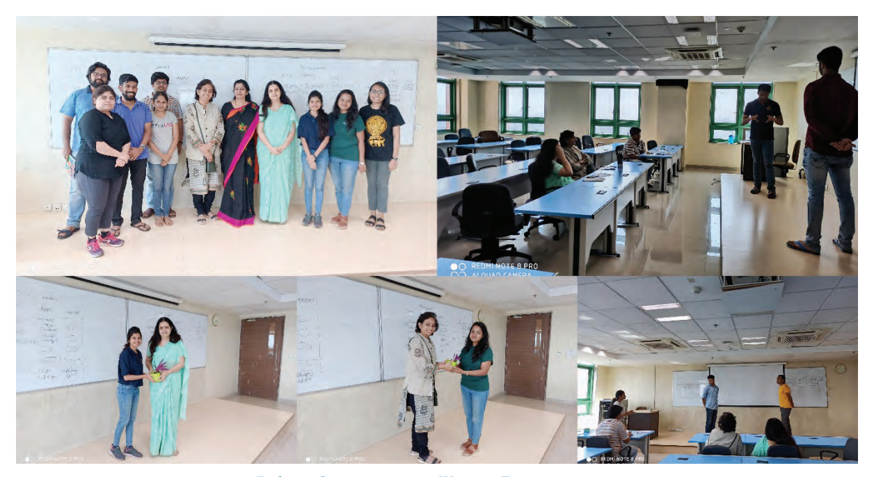
Debate Competition on Women Empowerment: