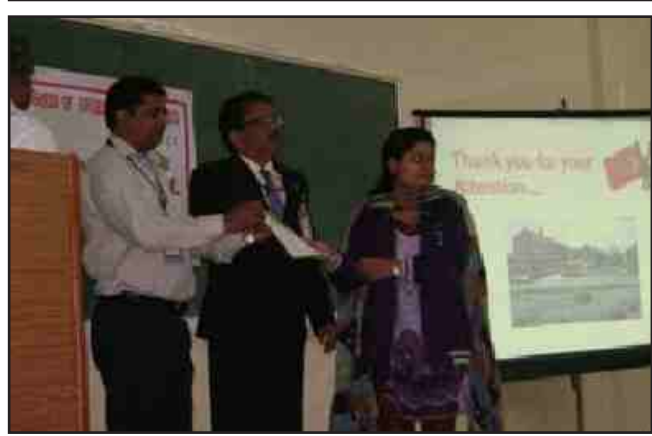
Papers and posters presented at ICER 13, Aurangabad