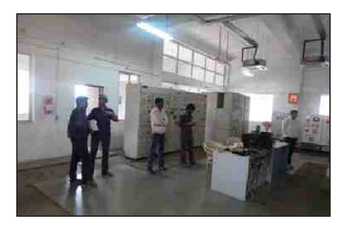
Hydro Electric Project at DHOM, Satara