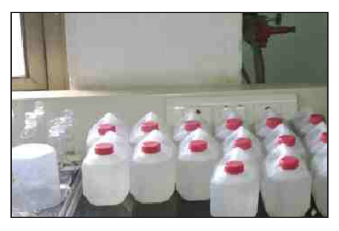
Water sample from Powai lake