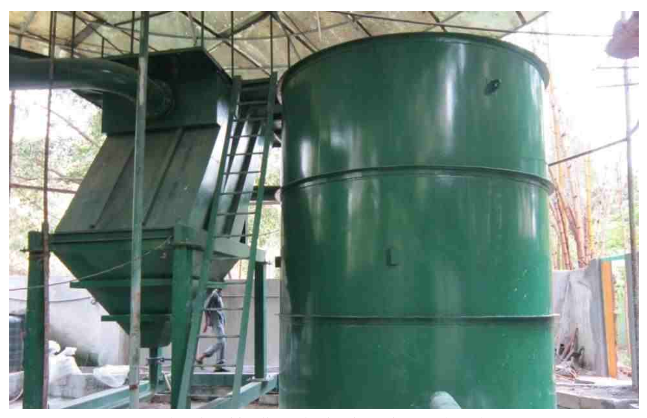
Site selected for pilot study Closed vessel composting unit Location: Nirvana Park, Hiranandani, Powai, Mumbai